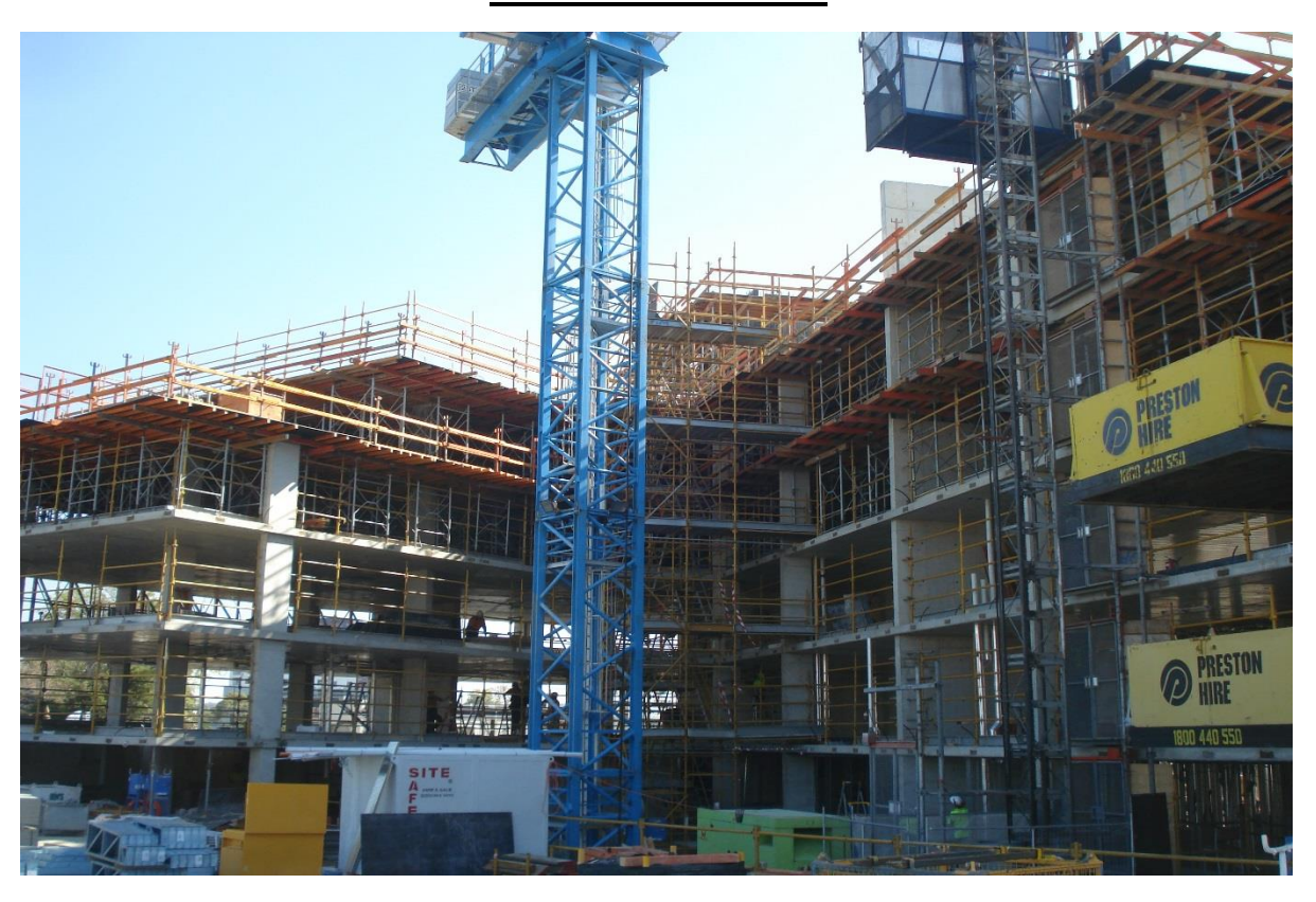
Ground – Townhouse West