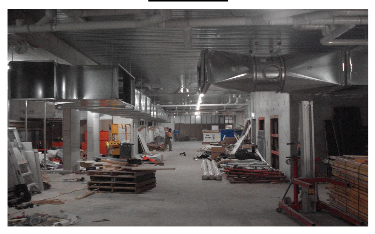
Basement - North