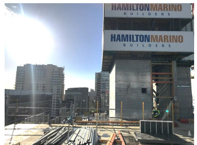
Fig. 4 & 5: Views from the Level 10 to City and Albert Park

so we may update our records accordingly.