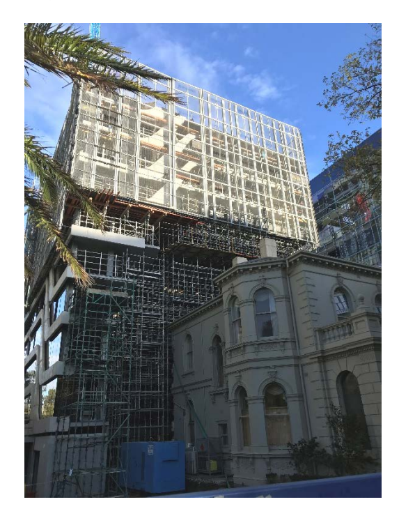
Fig 2&3: External View