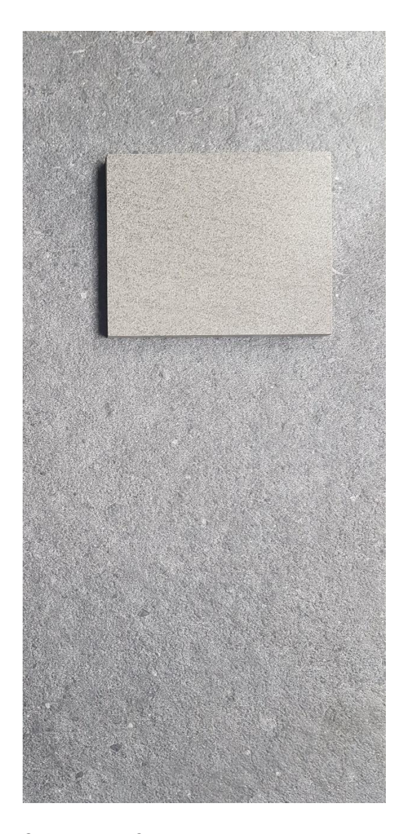
Smaller tile – Original selected tile

The Chelsea Group would like to advise that due to overseas supply issues, we have had to change the external balcony tile type. Please refer below for the tile now chosen for your apartment balcony.